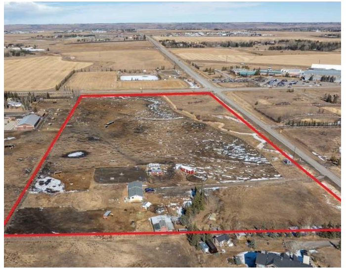
ALBERTA LAND SURVEYOR'S REAL PROPERTY REPORT Page 2 of 2

Offering of 19.2 Acres of development land located immediately SW of Springbank High School and the Springbank Park for All Seasons. Legal title of (East \frac{1}{2} ) Subdivision 16 NE-21-24-03-05, owned by the existing family since 1960 and currently leased to a local horse operation. The current zoning designation is Residential, Rural District (R-RUR). In the Draft 2024 Springbank Area Structure Plan, this parcel of land has a future zoning as Infill Residential where future lots in the infill residential area will range between +0.8 to +1.6 ha (+2 to. +4 acres) in size, or whatever is most prevalent on adjacent lands or in the immediate area. This parcel can be serviced for water by CalAlta and the water line can be tied into at the Springbank High School hub. This has been confirmed to be within the CalAlta area for servicing. The cost to tie into this service can be discussed with CalAlta directly. The current owner attended 2024 Public Hearings for the Springbank Area Structure Plan and presented amendments to this particular parcel that they felt would enhance future development possibilities to this area and the Springbank community. A future owner may consider utilizing this parcel of land with its current land designation or may also consider working with a planning and independent consultant if they wish to apply to Rocky View County to change the land use designation, being that community and